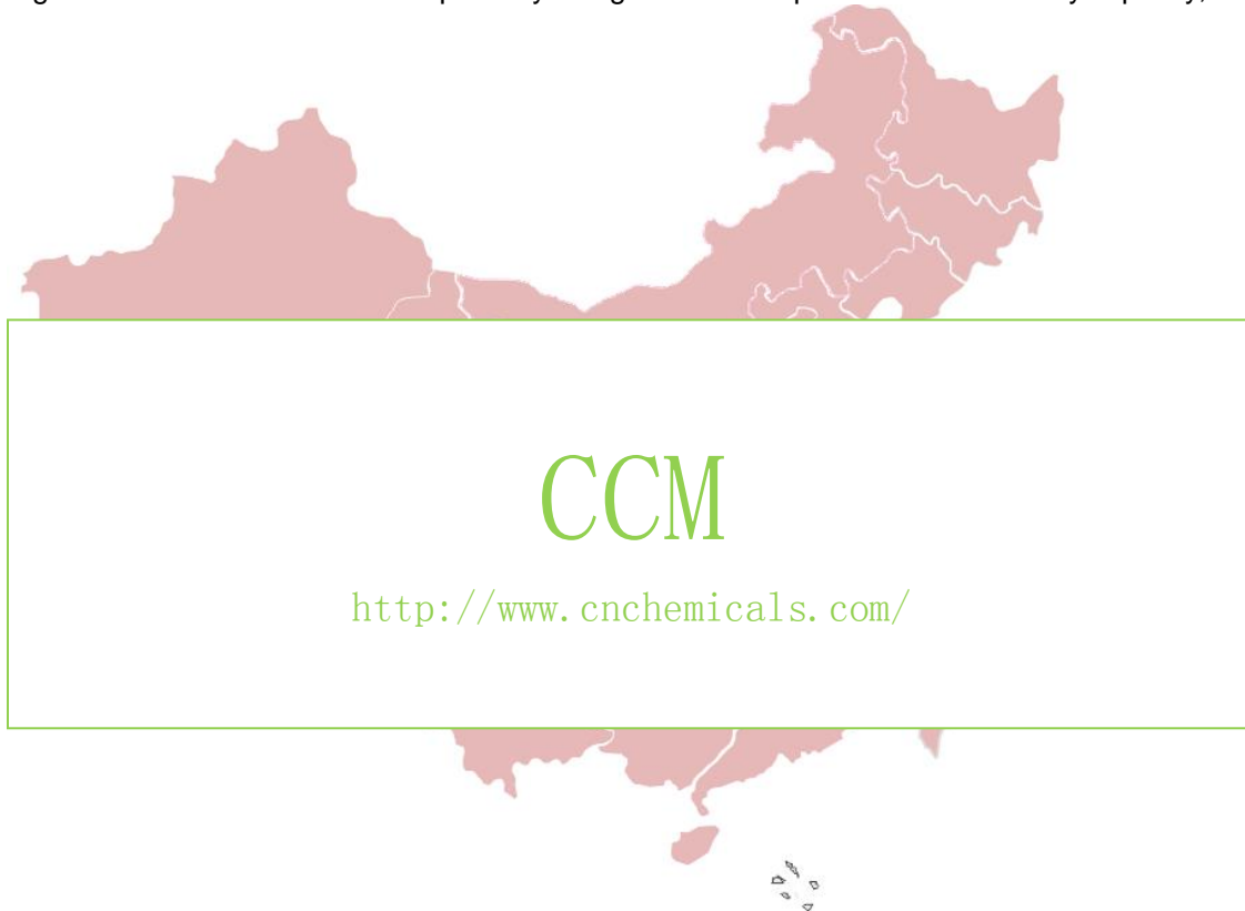
Figure 7.2-1 Distribution of the top five xylo-oligosaccharide producers in China by capacity, 2016